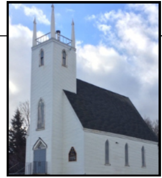
St. Mark's Church, Mill Cove