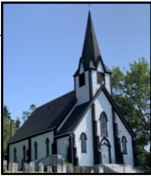
St. Luke's Church, Hubbards