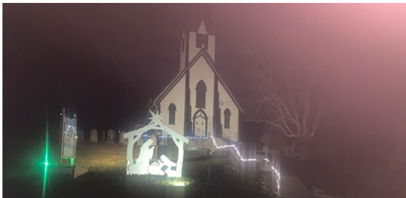
Christmastime at our two churches – St. Luke's (above) and St. Mark's (right).